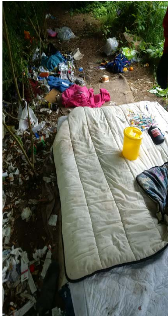
Bevois Ward - Southampton