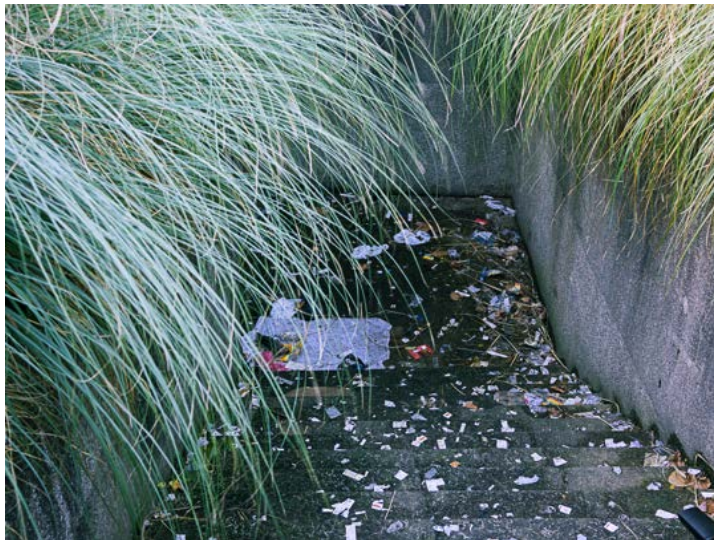
Drug litter found near Six Dials, photos courtesy of Nigel Brunson. Injecting Advice.com