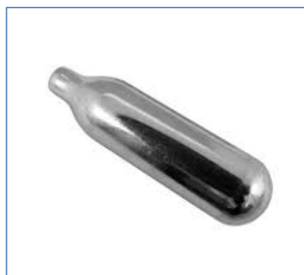
A nitrous oxide canister